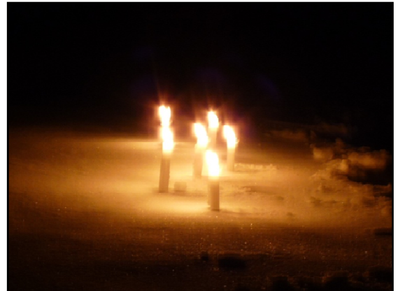
Candles in the snow at the 2012 Winter Solstice service