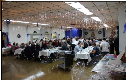
Above: The beautifully decorated venue. Below: gift baskets