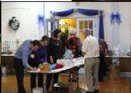
Below: Some serious bidding