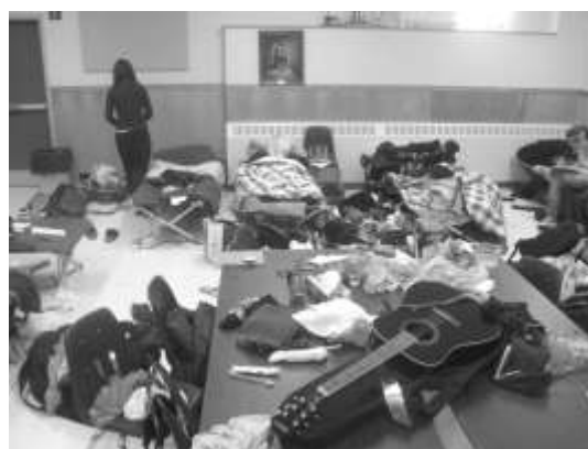
Oh So Clean Sleeping Quarters