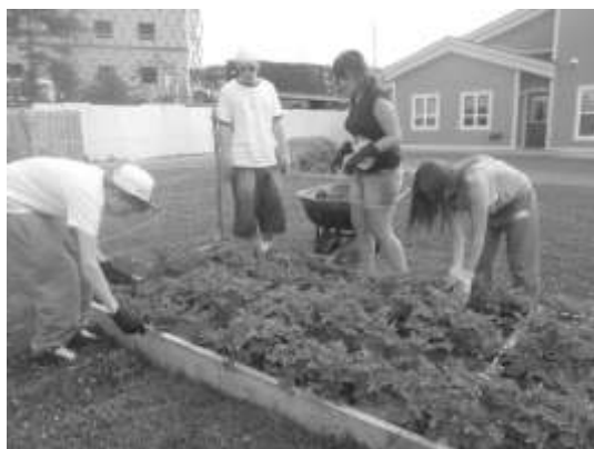
Garden - Tommy Sexton Centre