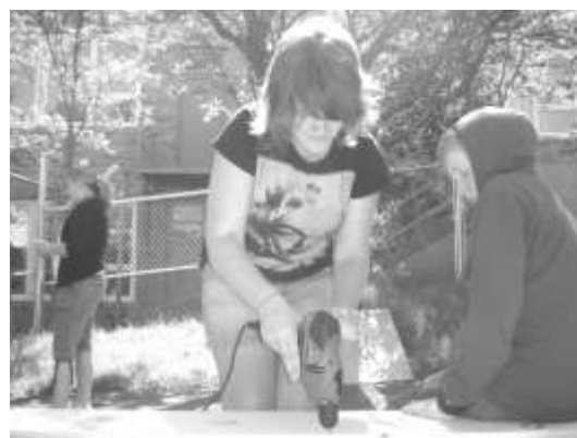
Using Power Tool at Street Reach