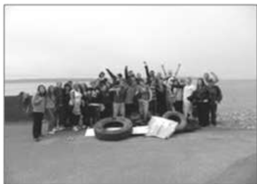
Beach Clean Up