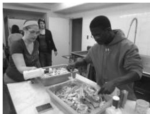
Making Salad for the Homeless